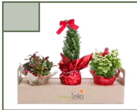
Table Top Trio

A beautiful, ceramic, patterned bowl is 9" in diameter - perfect for your coffee table or as a housewarming gift. An assortment of popular succulents are planted with a flowering kalanchoe in the center.