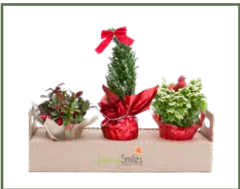
Table Top Trio

The popular wreath is getting an upgrade! A large, plaid bow is featured in the middle of fresh noble, cedar and juniper. Frosted pinecones and red berries complete the new look - ready to welcome guests at your door!