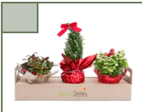
Table Top Trio

A beautiful, ceramic, patterned bowl is 9" in diameter - perfect for your coffee table or as a housewarming gift. An assortment of popular succulents are planted with a flowering kalanchoe in the center.